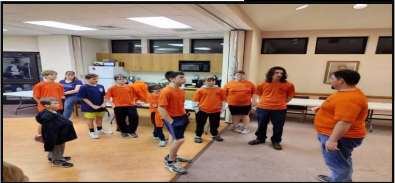
Thank you to our Scouts for their help in setting up and taking down Craft Fair room arrangements